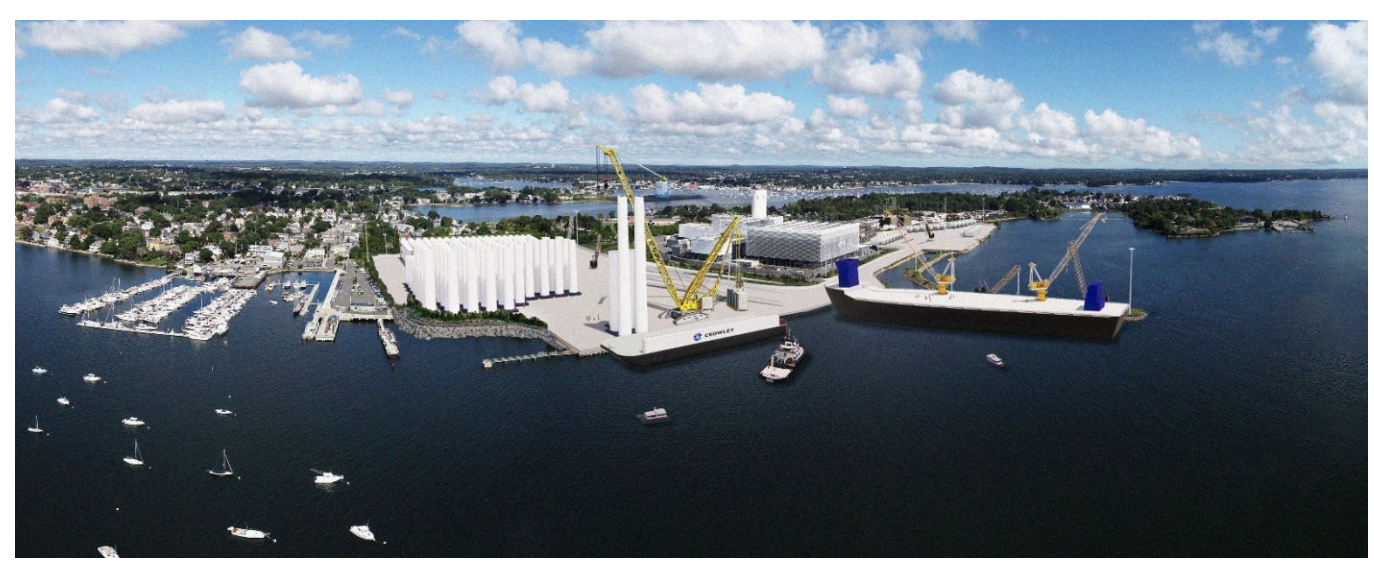
Figure 2 - Conceptual rendering of the proposed terminal development